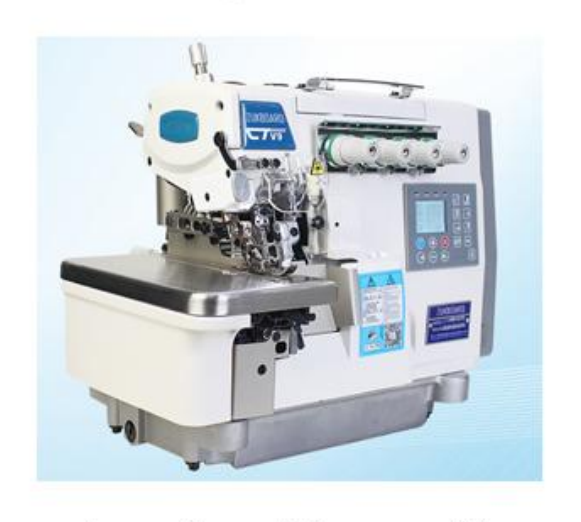
automatic welting machine