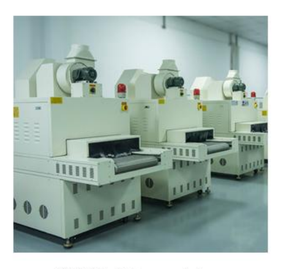
UV light machine