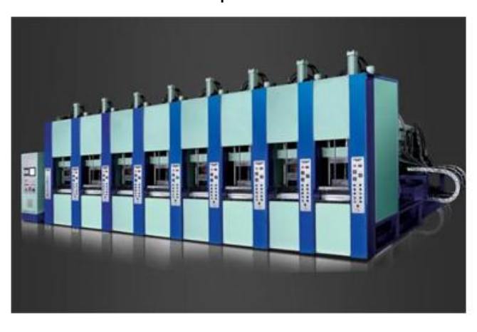
EVA injection machine