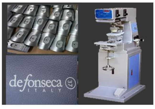
Pad Printing Machine