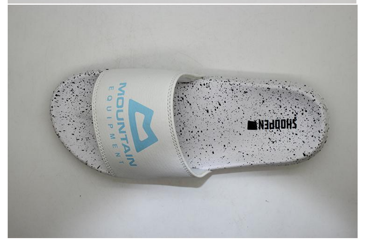
Vedio of Mens Summer Slides Our workshop